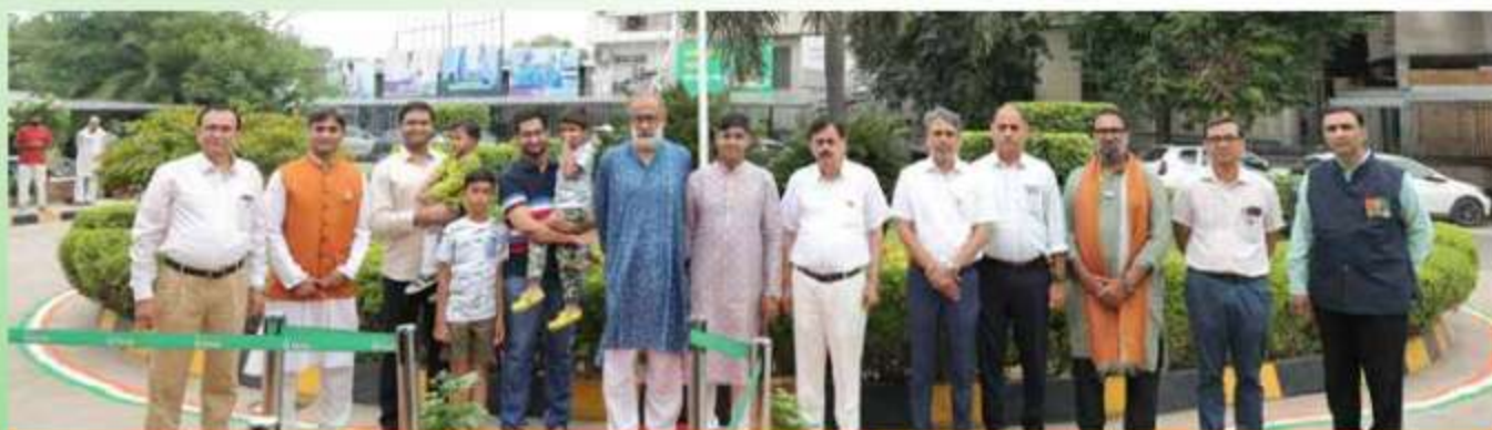
Fortis Escorts Hospital, Jaipur