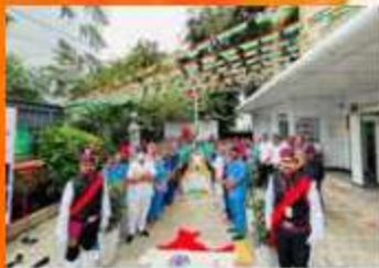
Fortis Hospital, Nagarbhavi