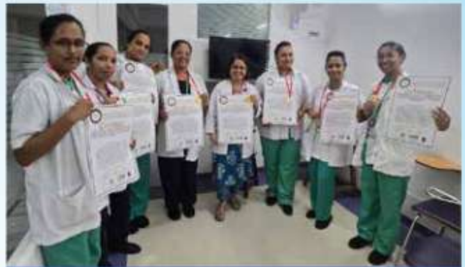
SL Raheja Hospital, Mahim - A Fortis Associate