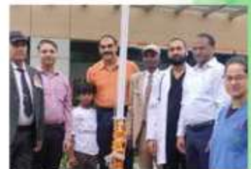
Fortis Escorts Hospital, Faridabad