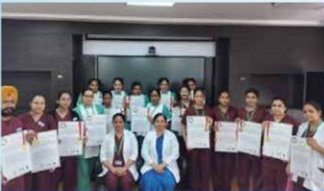
Fortis Escorts Hospital, Amritsar