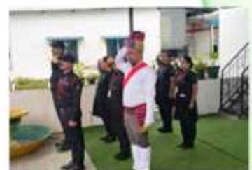
Fortis Hospital Rajajinagar, Bangalore