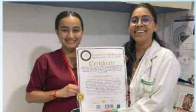
Fortis C-DOC, Chirag Enclave