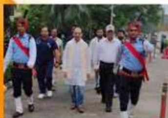
Fortis Hospital, Shalimar Bagh