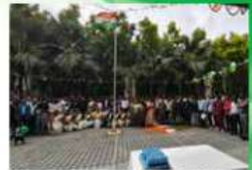
Fortis Hospital, BG Road, Bangalore