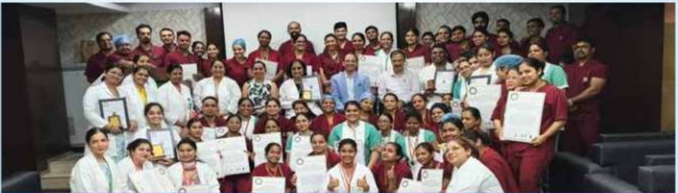
Fortis Hospital, Shalimar Bagh