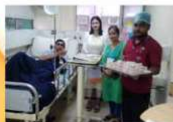
Fortis Hospital & Kidney Institute, Kolkata