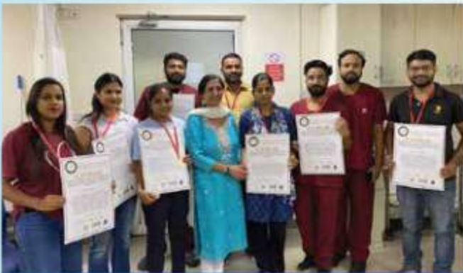
Fortis Hospital, Noida