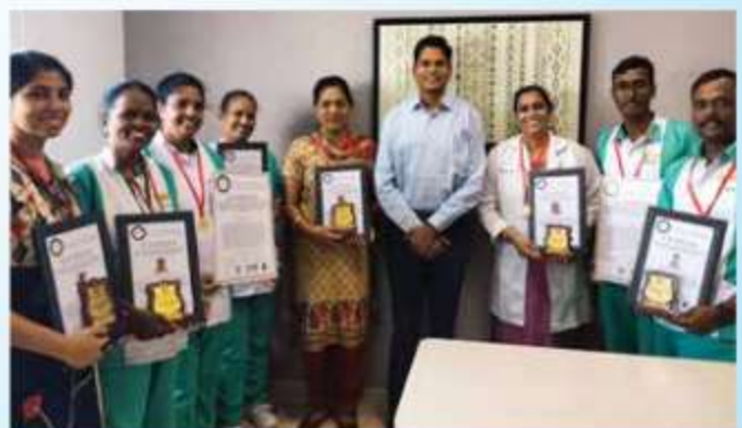
Fortis Hospital, BG Road, Bangalore