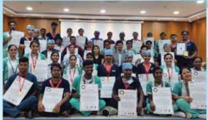
Fortis Hospital, Nagarbhavi