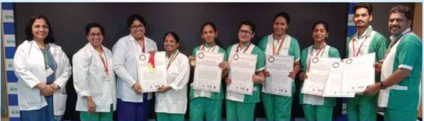
Hiranandani Hospital, Vashi - A Fortis Network Hospital