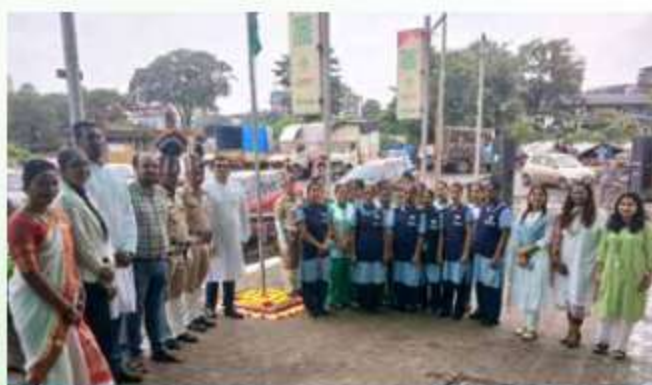
Fortis Hospital, Kalyan