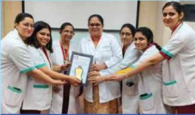
Fortis Escorts, Okhla Road