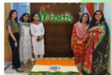
Corporate Office, Gurugram