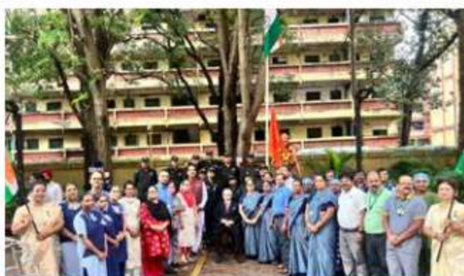
Fortis SL Raheja, Mahim - A Fortis Associate