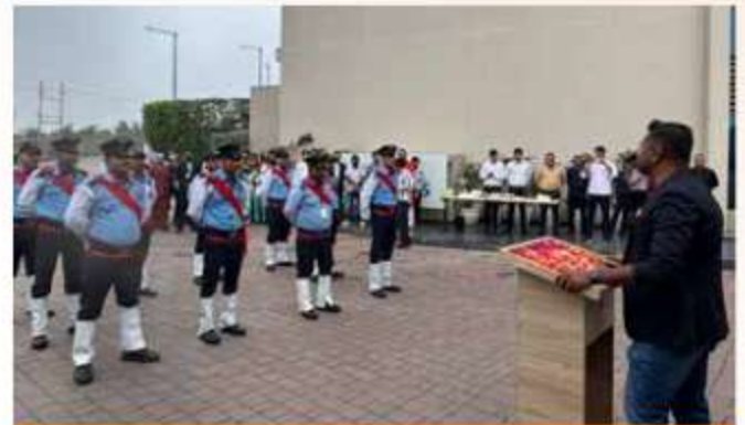
Fortis Hospital, Greater Noida