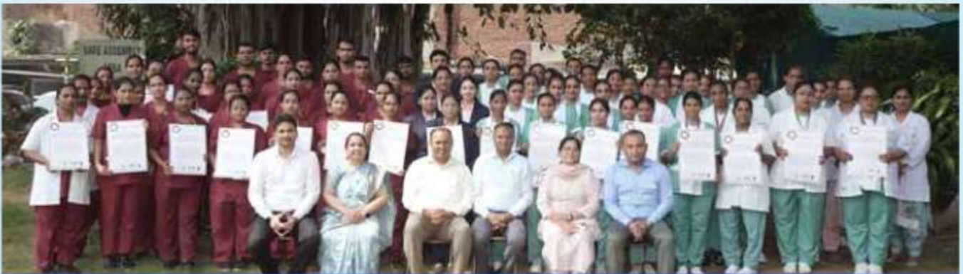
Fortis Escorts Hospital, Faridabad