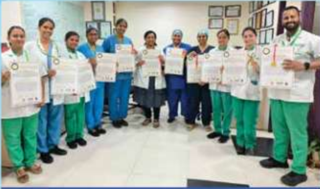
Fortis Hospital, Mulund