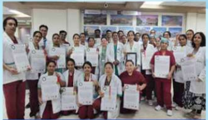
Fortis Hospital, Gurugram