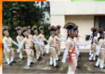
Fortis Hospital, Mulund