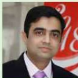
Shariq Roami Fortis Hospital, Shalimar Bagh