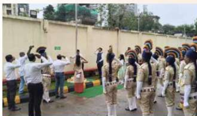
Fortis Hospital, Mulund