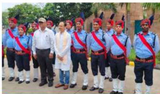
Fortis Hospital, Shalimar Bagh