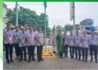
Fortis Hospital, Kalyan