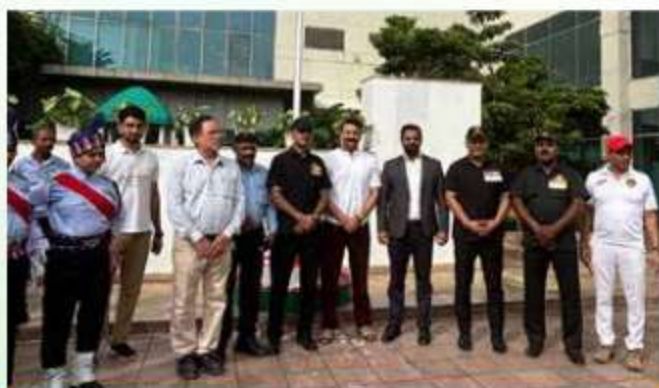
Fortis Hospital, Gurugram