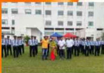
Fortis Escorts Heart Institute