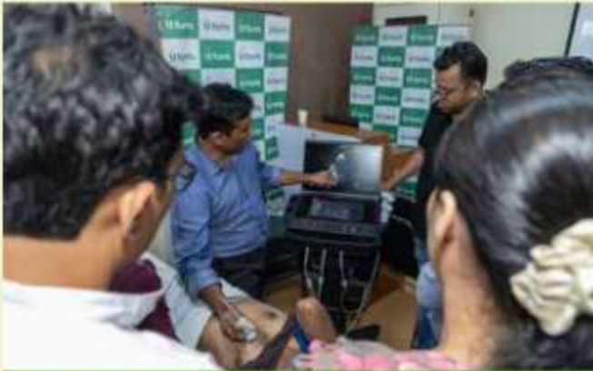
Live demonstration on patients during the 9th edition of the Point of Care Ultrasound in Emergency Medicine (POCUS in EM) workshop at Fortis Hospital, Mulund.