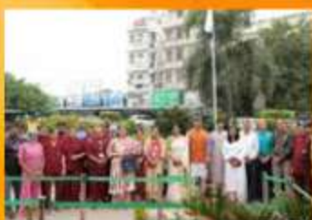
Fortis Escorts Hospital, Jaipur