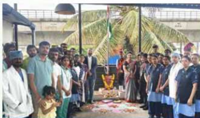
Fortis Hospital Rajajinagar, Bangalore