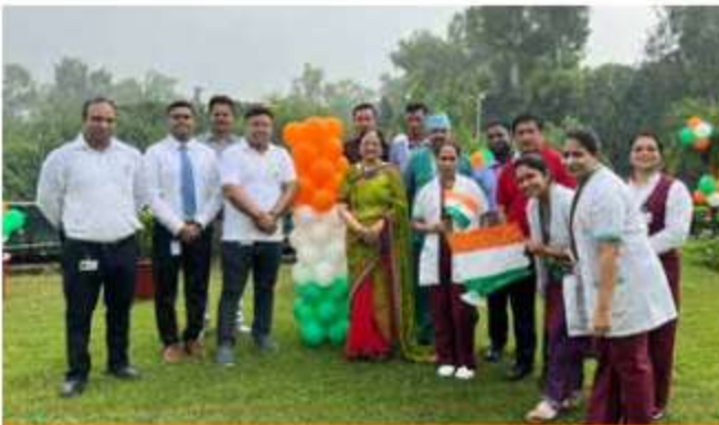
Fortis Escorts Heart Institute