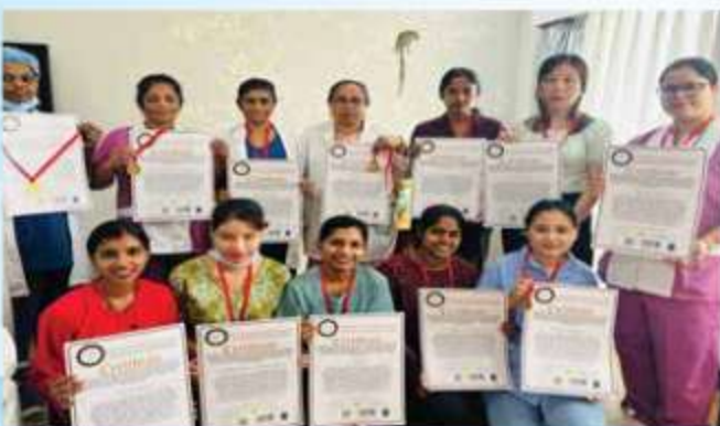
Fortis La Femme, GK II