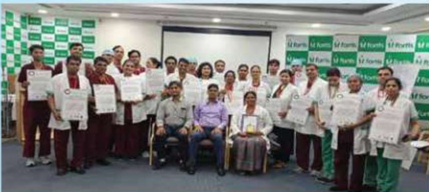
Fortis Escorts Hospital, Jaipur