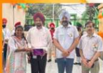
Fortis Hospital, Mall Road, Ludhiana