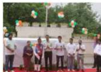
Fortis Hospital, Vasant Kunj