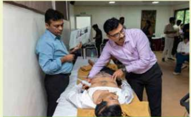
Hands-on training for core skills being demonstrated at Fortis Hospital, Mulund, during the 9th edition of Point of Care Ultrasound in Emergency Medicine (POCUS in EM) workshop.