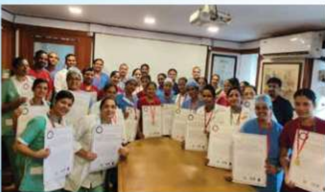
Fortis Hospital, CG Road, Bangalore