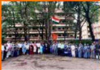
Fortis SL Raheja, Mahim - A Fortis Associate