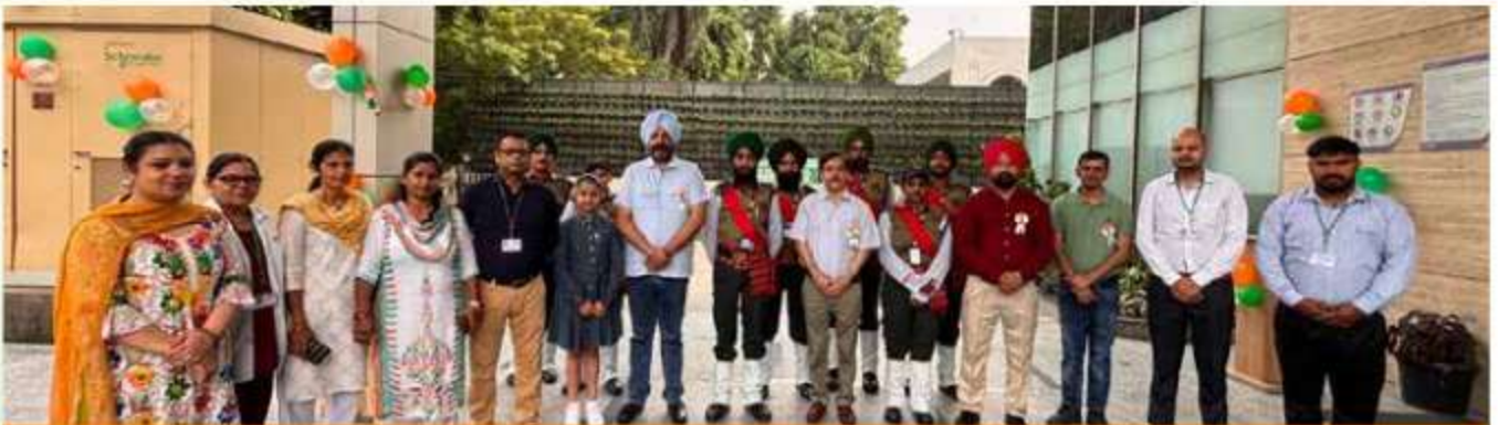
Fortis Hospital, Mall Road, Ludhiana