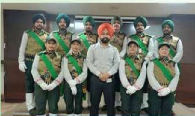
Fortis Hospital, Ludhiana