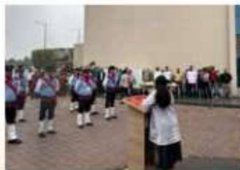
Fortis Hospital, Greater Noida