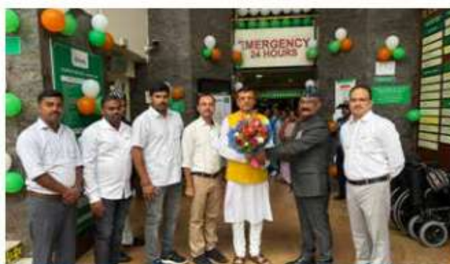
Fortis Hospital, CG Road, Bangalore