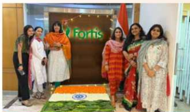
Corporate Office, Gurugram