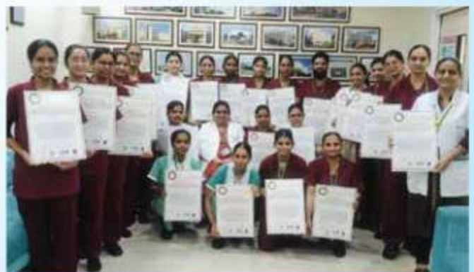
Fortis Hospital, Ludhiana