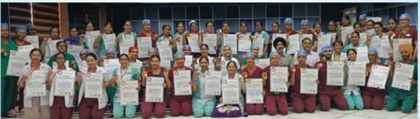
Fortis Hospital, Mohali