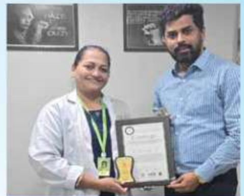
Fortis Hospital, Kalyan