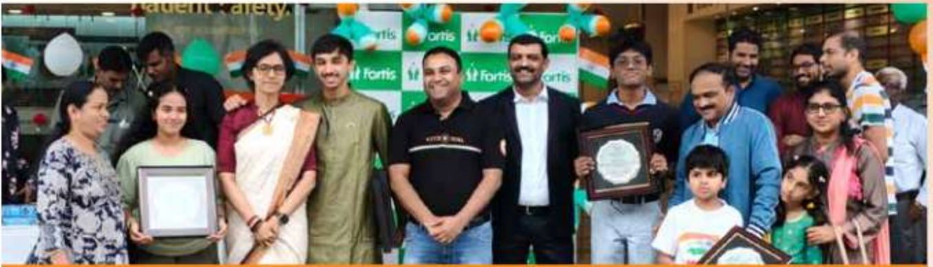
Fortis Hospital, BG Road, Bangalore