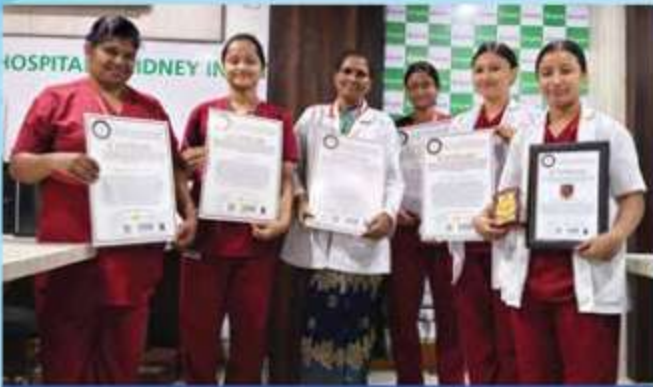
Fortis Hospital & Kidney Institute, Kolkata