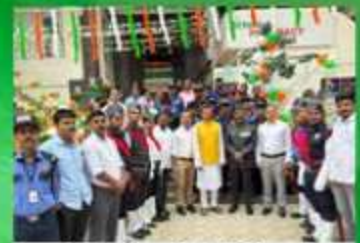
Fortis Hospital, CG Road, Bangalore