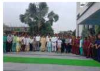
Fortis Hospital, Ludhiana