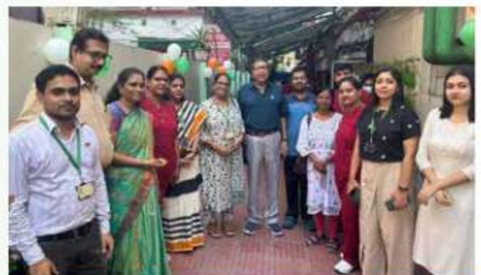
Fortis Hospital & Kidney Institute, Kolkata