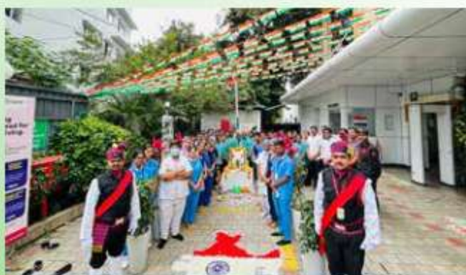
Fortis Hospital, Nagarbhavi, Bangalore