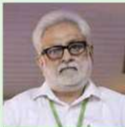
Pankaj Bakhu Corporate Office, Gurugram