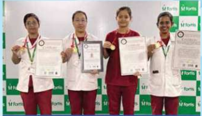
Fortis Hospital, Anandapur