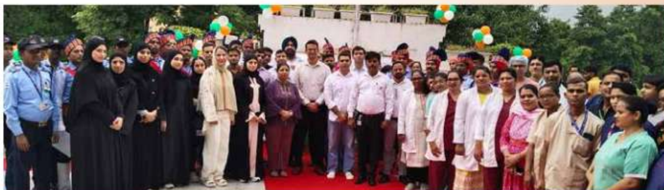
Fortis Hospital, Vasant Kunj