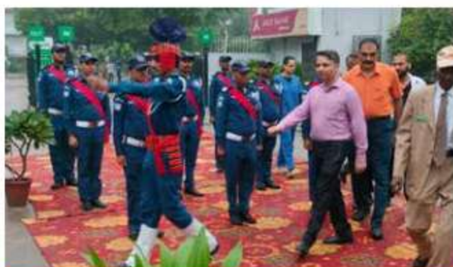
Fortis Escorts Hospital, Faridabad