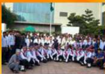
Fortis Hospital, Gurugram